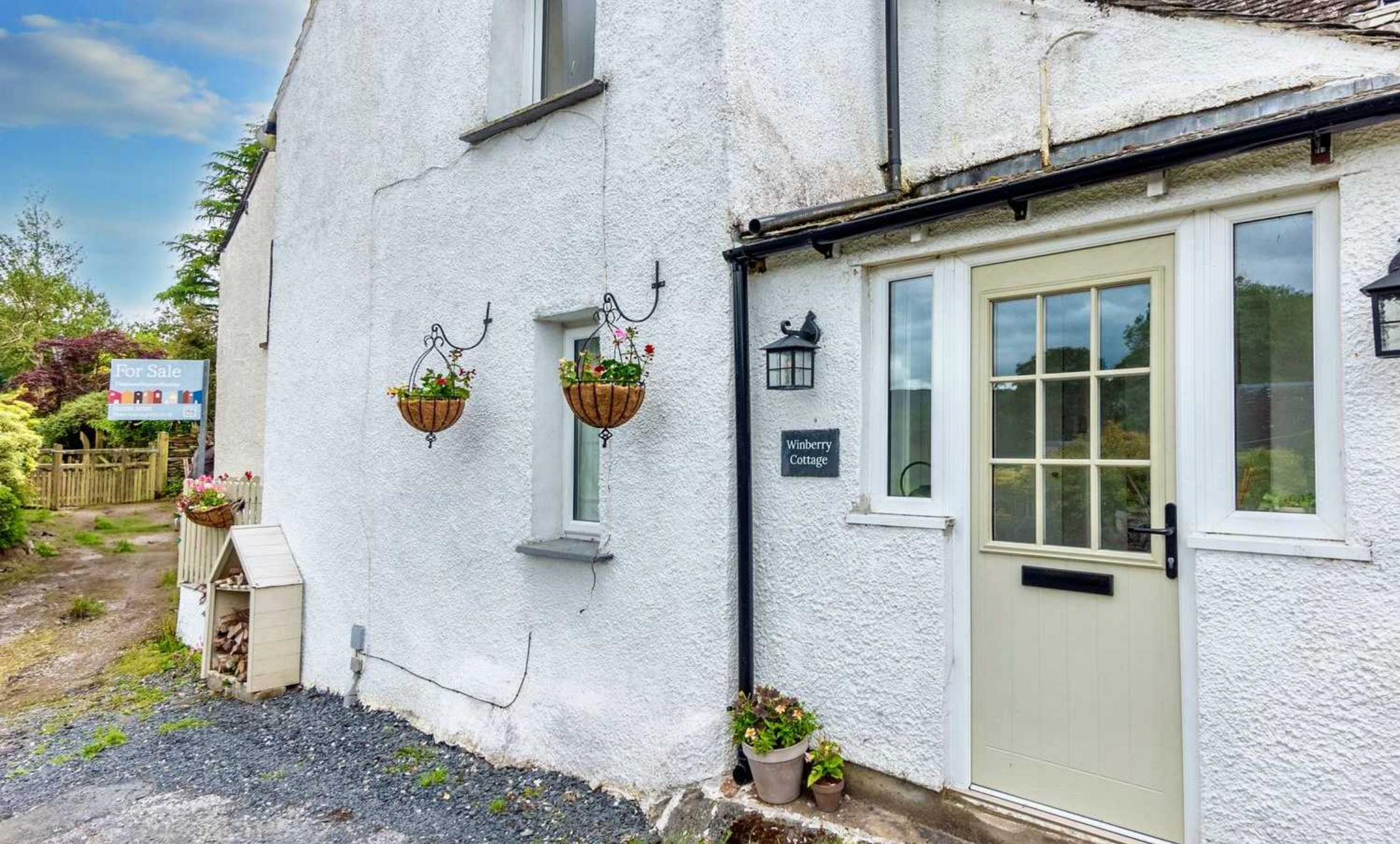
Winberry Cottage, Finsthwaite £300,000