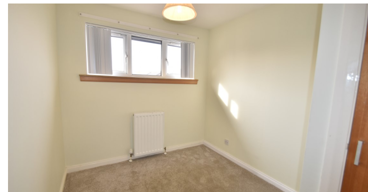
117 Langton View