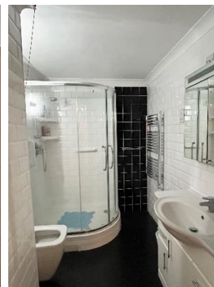
Please note: Some furniture items have been removed from the property