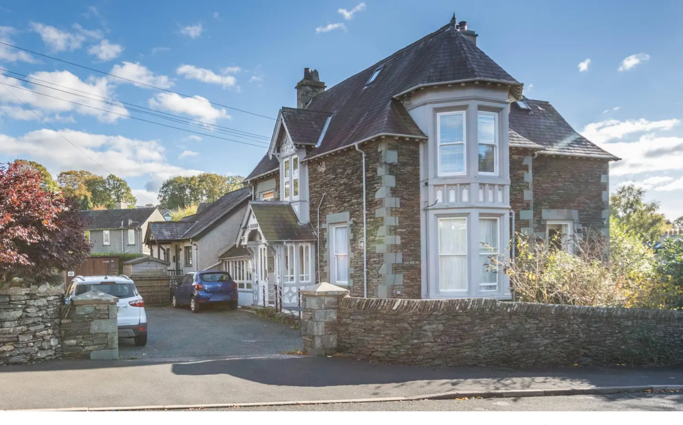
Flat 8, Denewood Queens Drive, Windermere £200,000