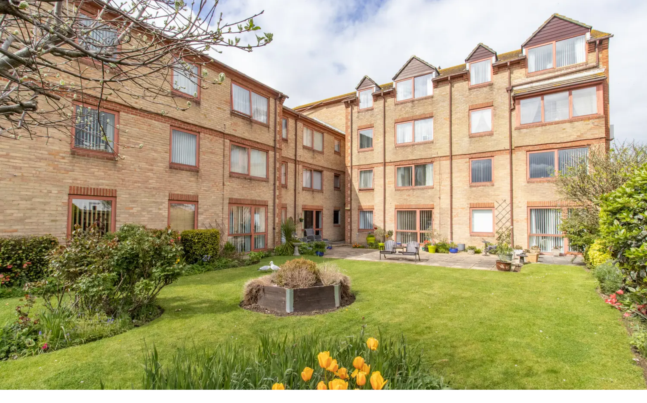
Flat 5, Cavendish Court High Street, Herne Bay £120,000