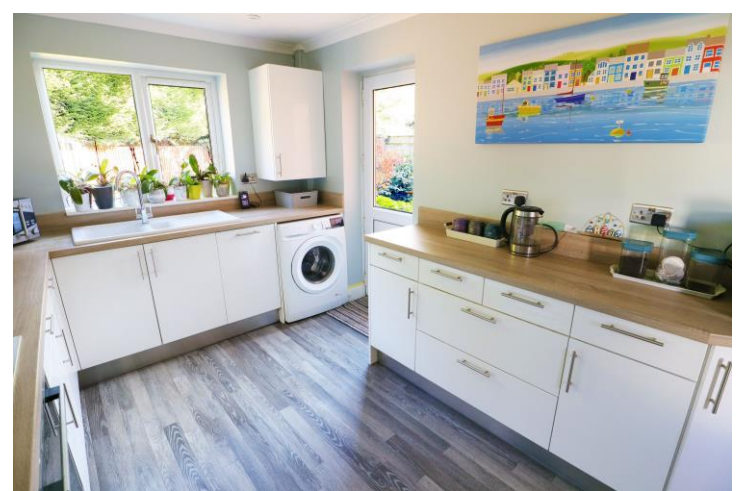
Utility Room 2.37 x 1.81