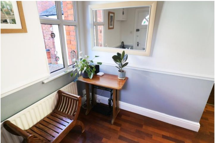
Lounge 12'10" x 12'0" (3.90 x 3.65)