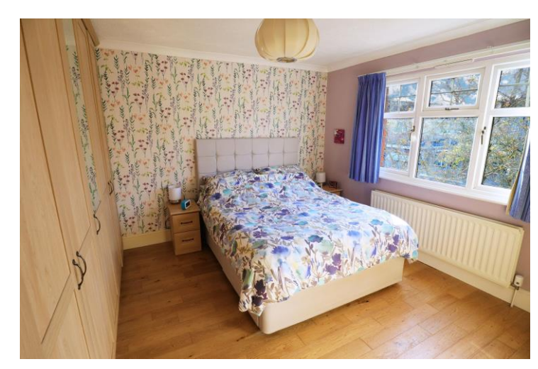
Bedroom Two 12'8" x 11'11" (3.87 x 3.64)