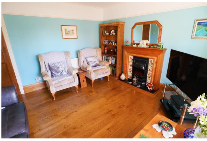
Dining Room 12'10'' x 11'11'' (3.90 x 3.64)