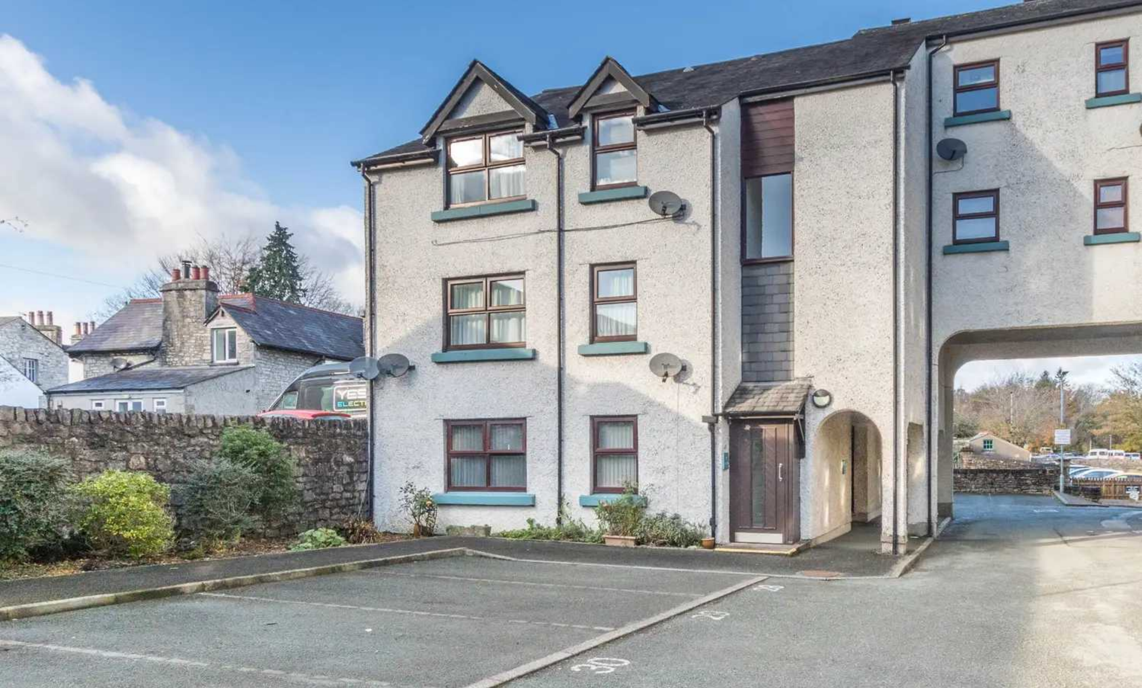
Flat 29, County Mews Sandes Avenue, Kendal £120,000