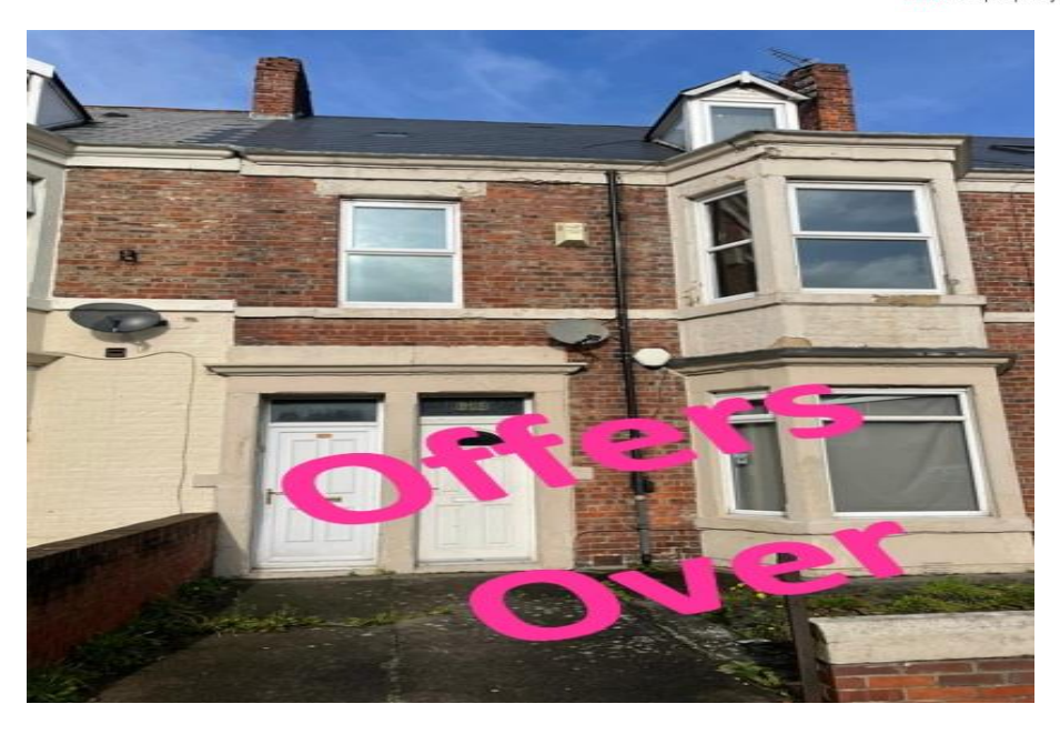
611 Welbeck road, Walker, Newcastle Upon Tyne £89,950

David Robson and Associates now welcome to the market this large 3 bedroom maisonette located on Welbeck Road. A perfect opportunity for an investor or first time buyer looking for a project. This property needs some updating, however it does have amazing potential to be beautiful.