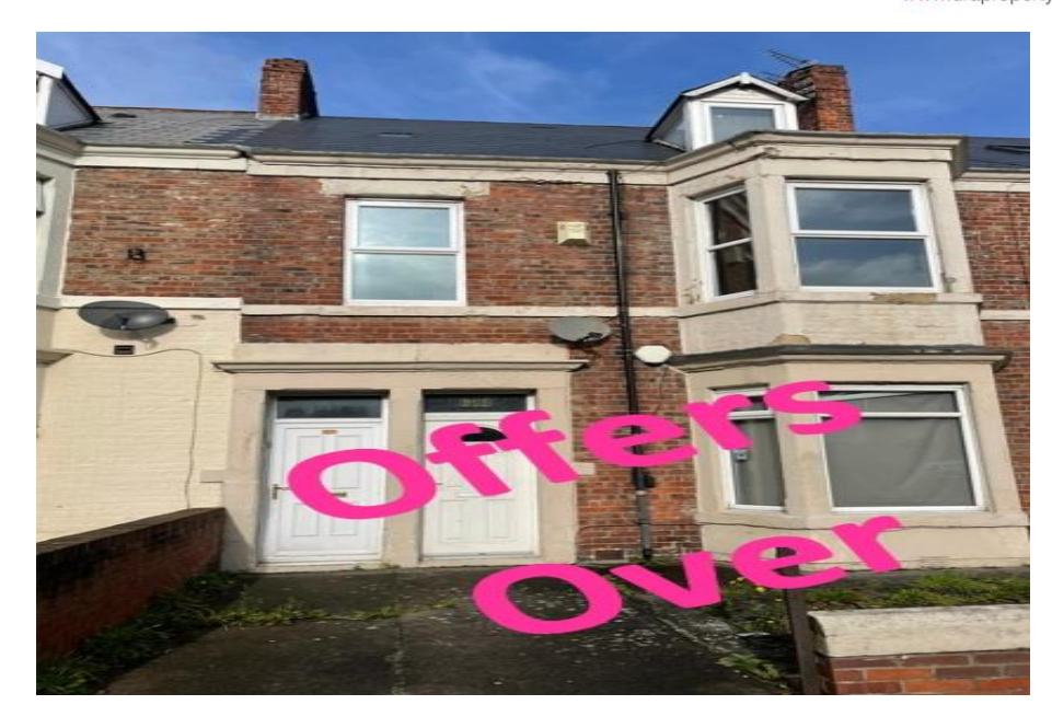
611 Welbeck road, Walker, Newcastle Upon Tyne £86,950

David Robson and Associates now welcome to the market this large 3 bedroom maisonette located on Welbeck Road.