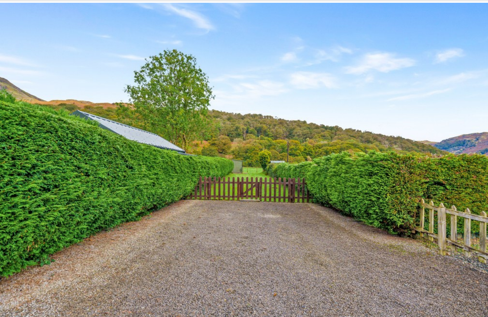
Rear Allocated Parking Area