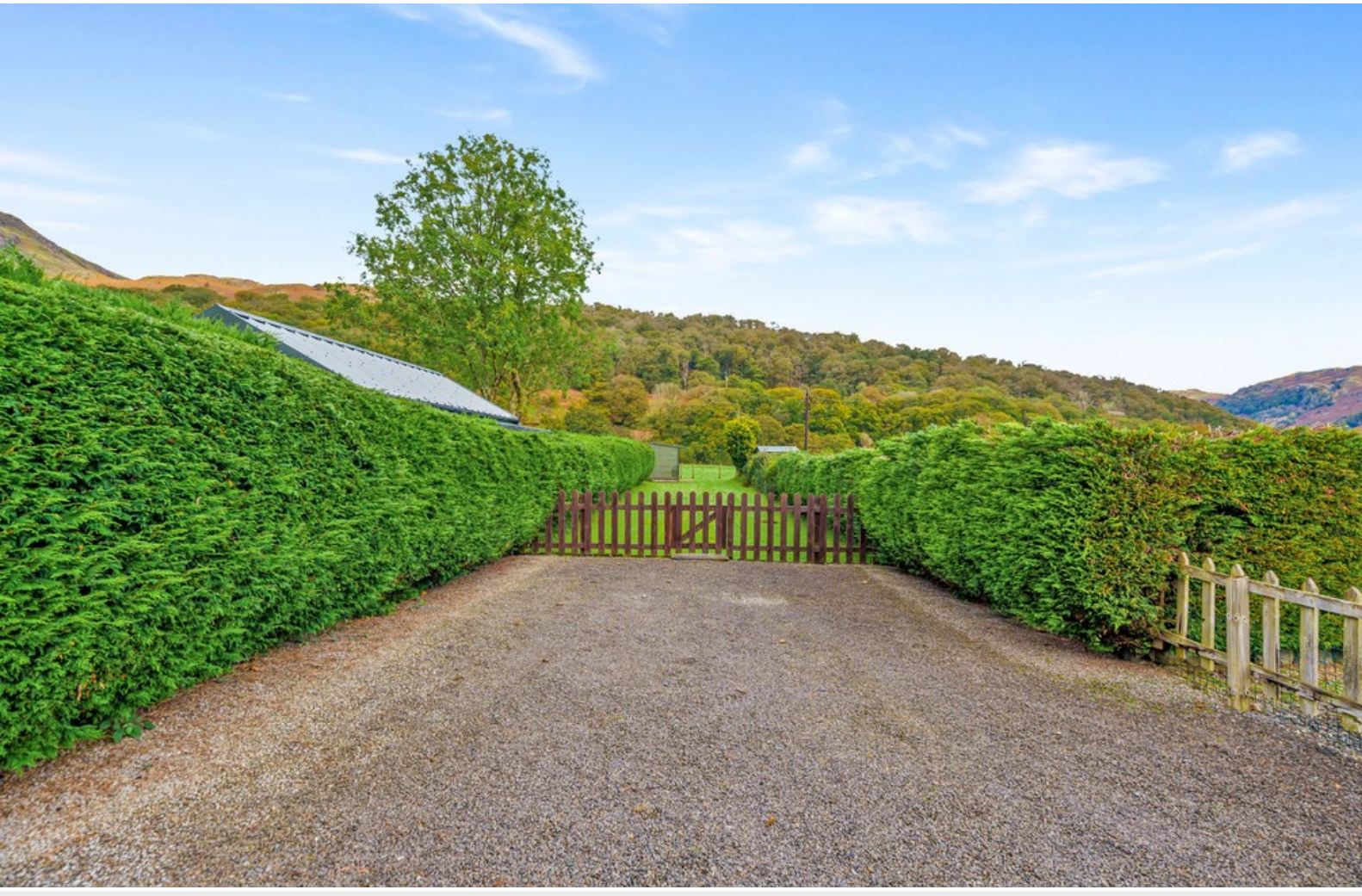
Rear Allocated Parking Area