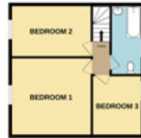
1ST FLOOR 339 sq.ft. (31.2 sq.m.) approx.