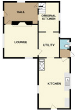
GROUND FLOOR 770 sq.ft. (71.2 sq.m.) approx.