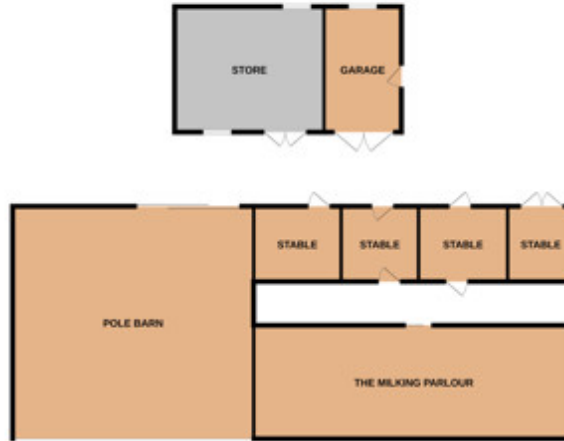
EXTENSION 1382 sq.ft. (127.8 sq.m.) approx.