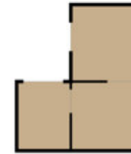
UNFINISHED 1ST FLOOR 389 sq.ft. (35.7 sq.m.) approx.