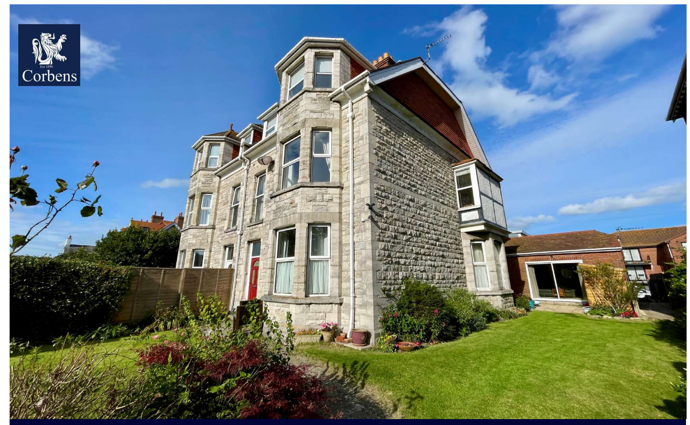
FLAT 3, 12 GILBERT ROAD, SWANAGE £299,950 Leasehold