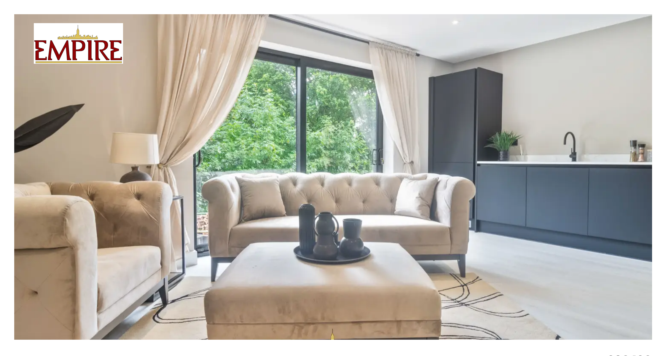
City Green, APT 14, 2096 Coventry Road Birmingham