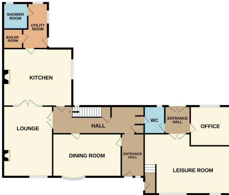
1ST FLOOR 2079 sq.ft. (193.1 sq.m.) approx.