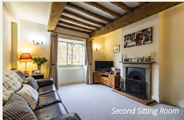
Second Sitting Room