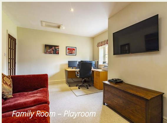
Family Room – Playroom