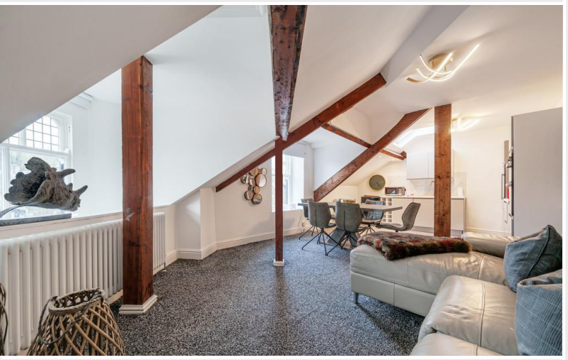
Open Plan Living Room