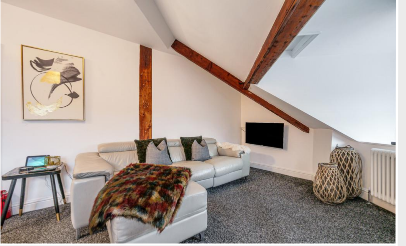
Open Plan Living Room