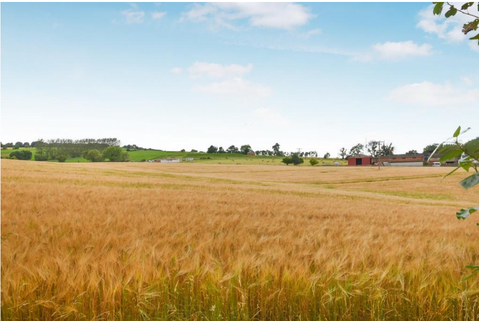
Next Home - Mardon, Burnhead Road, Blairgowrie, PH10 6SY