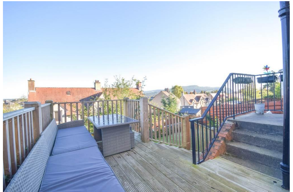
Next Home - 43 Woodside Crescent, Perth, PH2 0EW