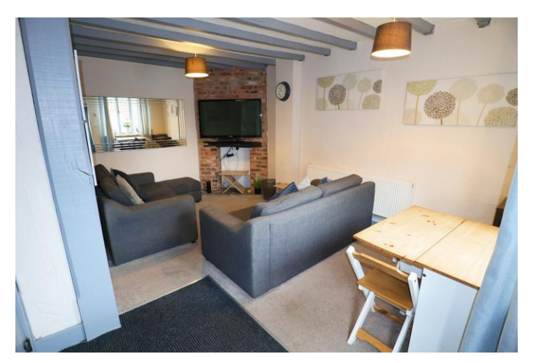
Lounge 16'2" x 11'6" (4.92 x 3.50)