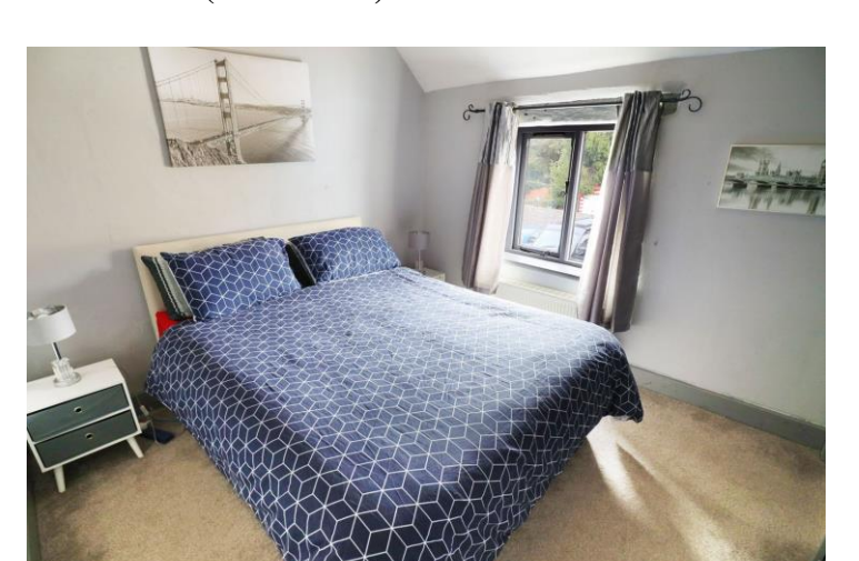
Bedroom One 9'9" x 9'9" (2.98 x 2.96)