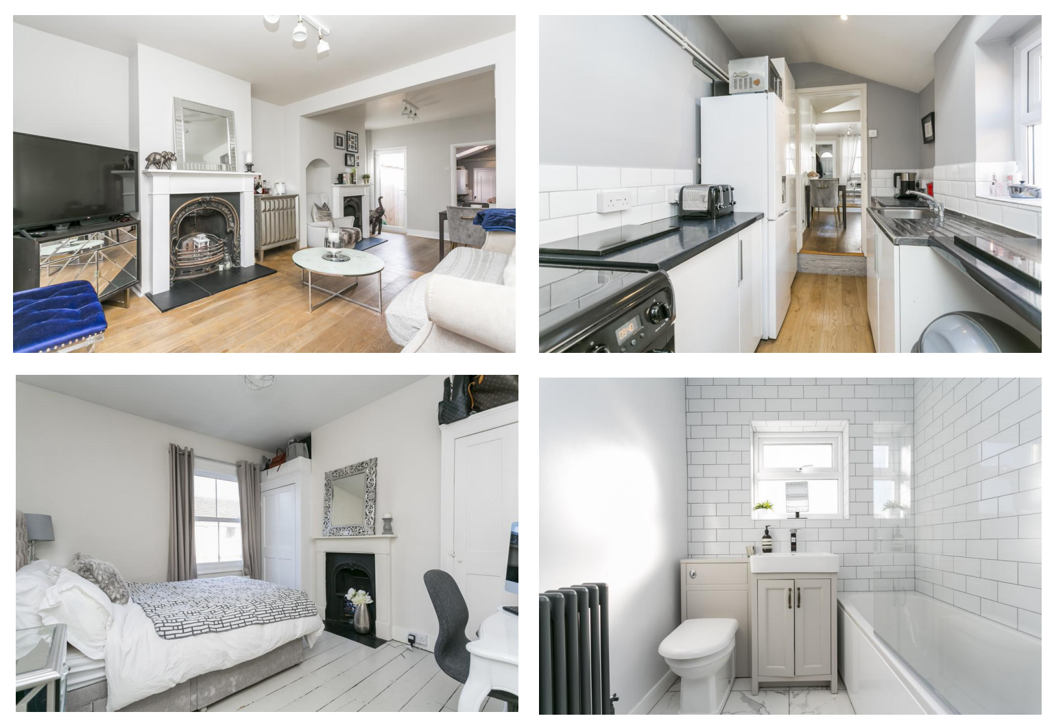
Lavender Hill, Tonbridge, TN9 2AT

Perfectly situated for commuters in a popular central location, this 2/3 Bedroom mid terrace property offers beautifully presented and versatile accommodation within a few minutes walk of both the Main Line Station and Town Centre. The house offers a wonderful blend of modern décor with original features retained throughout, and is to be redecorated and re carpeted before a new Tenancy begins. The house is Double glazed with Gas Central Heating and has a low maintenance rear Garden with a recently laid patio over two levels.