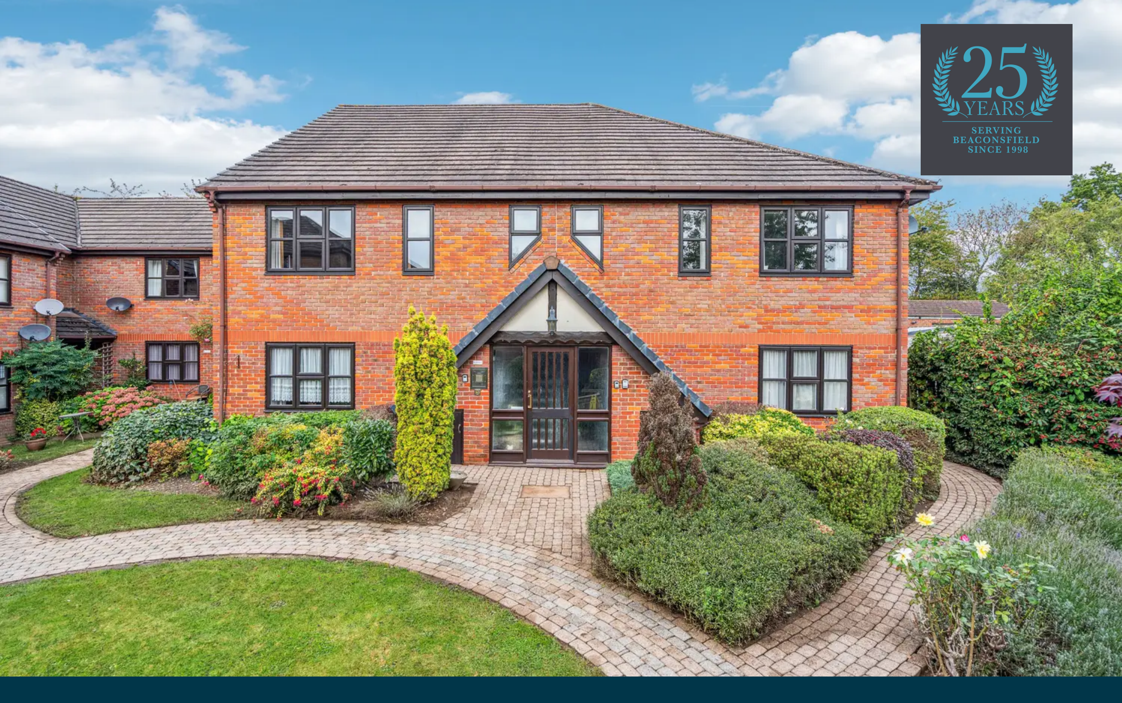
Flat 26, The Hollies Maxwell Road, Beaconsfield Guide Price £425,000