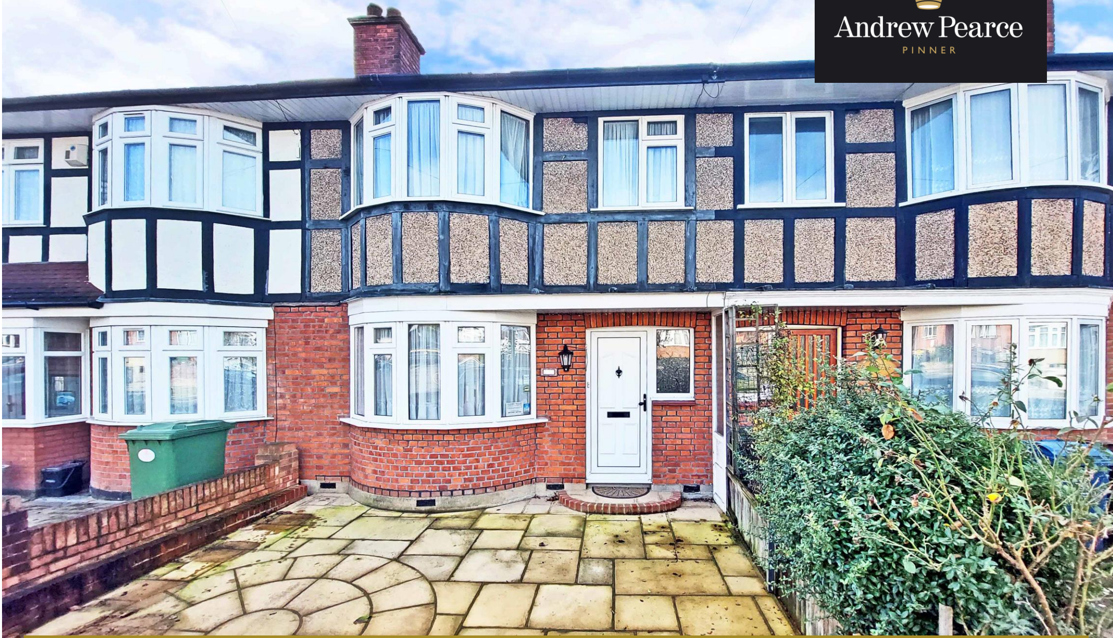
CAPTHORNE AVENUE, HARROW, MIDDLESEX HA2 9NF £515,000