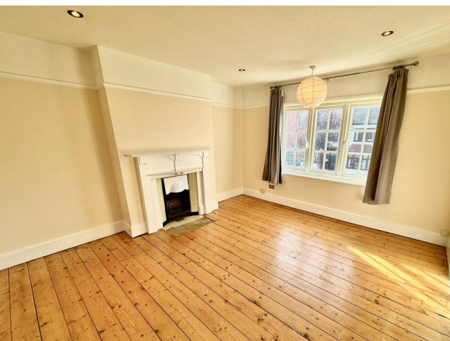
appointment to view!