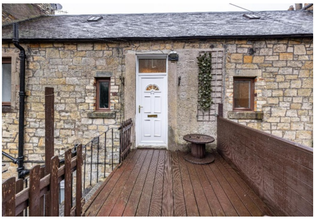
11C Myreslawgreen, Hawick

Approximate Gross Internal Area = 79.4 sq m / 855 sq ft