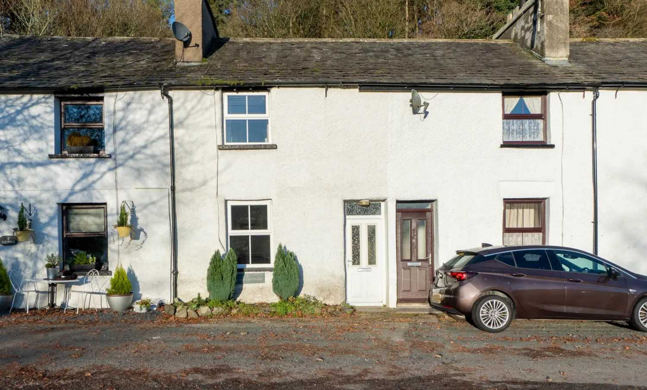
3 Reston Cottages, Staveley £260,000