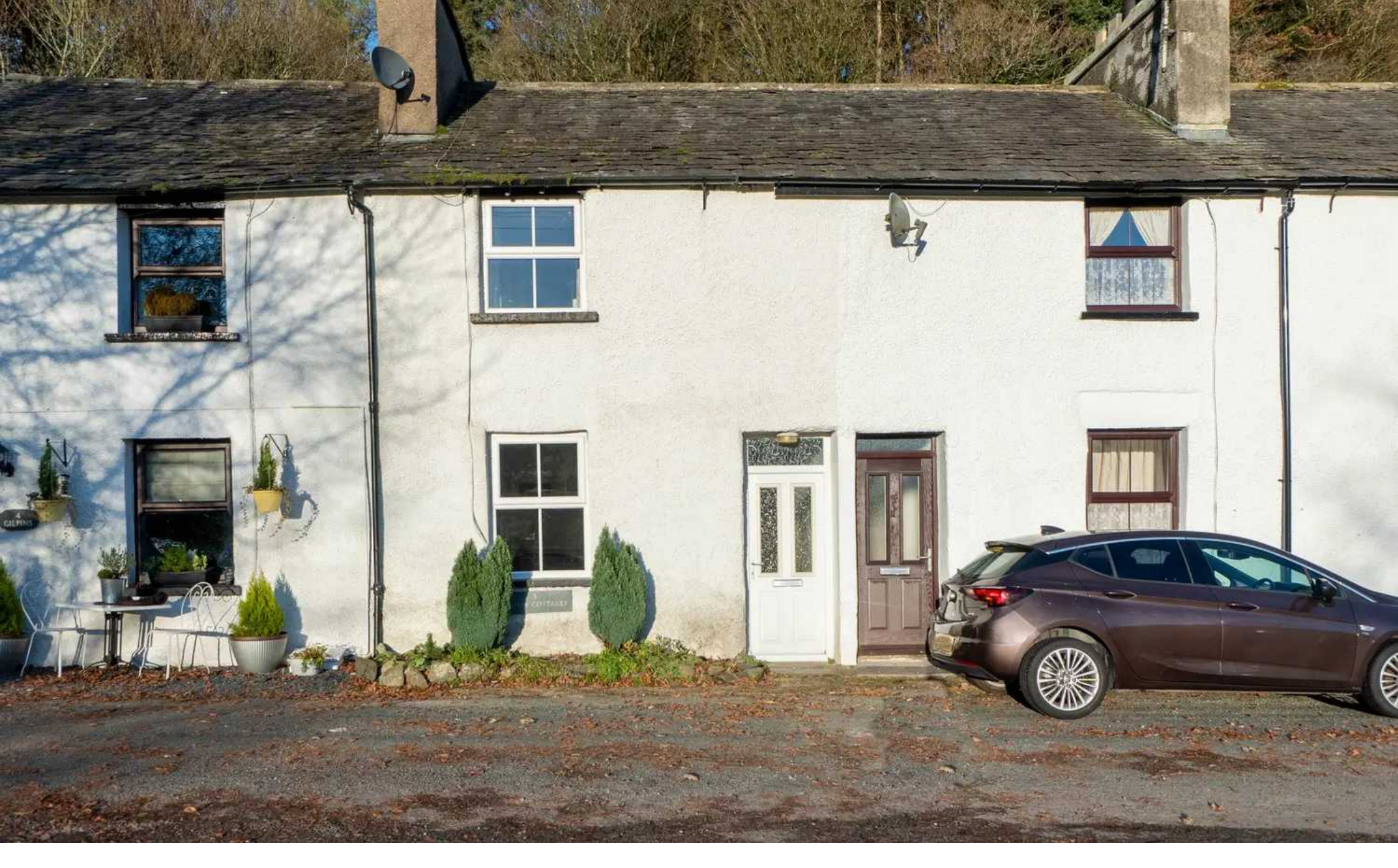
3 Reston Cottages, Staveley £249,950