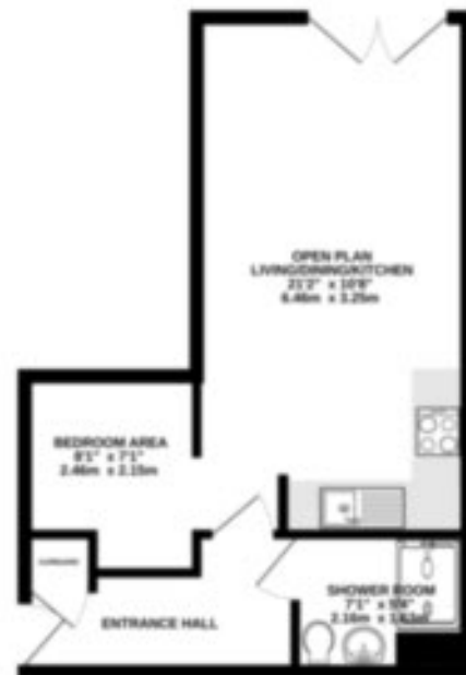
TOTAL FLOOR AREA: 390 sq ft (35.3 sq m.) approx. Measurements are approximate. We do not warrant the accuracy of these measurements. Please contact us for more information.