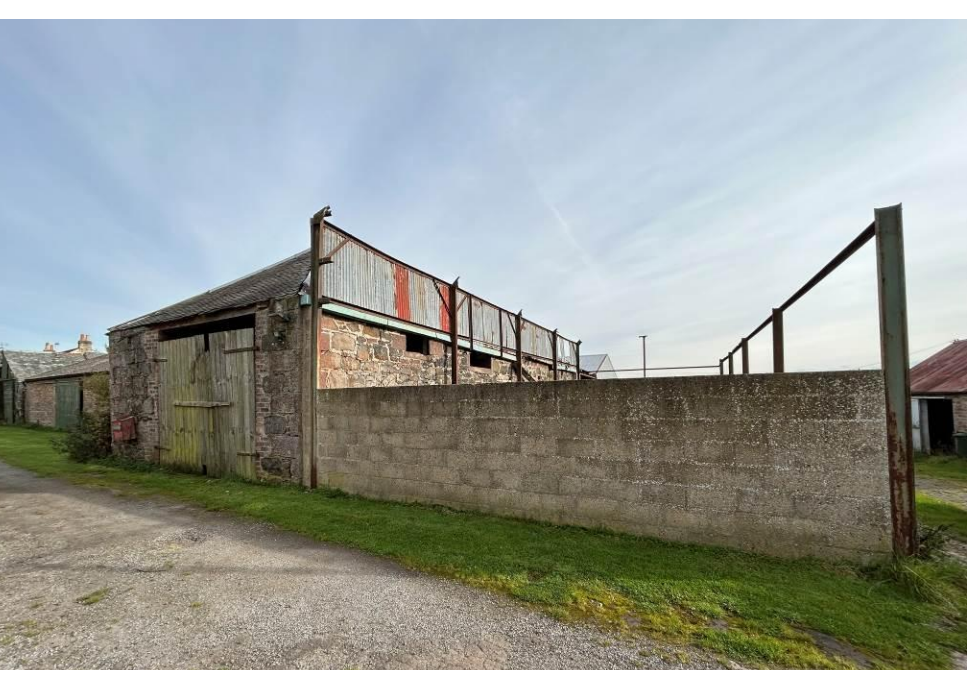
Next Home - Westbank Farm, St Davids, Madderty, Crieff, PH7 3PP