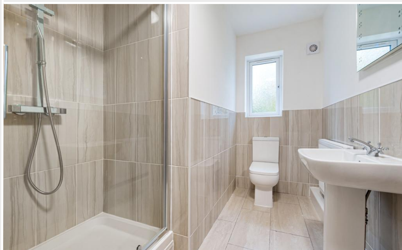
Family Shower Room