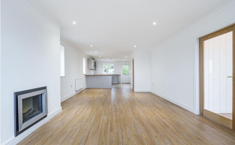
Open Plan Living/Dining Area