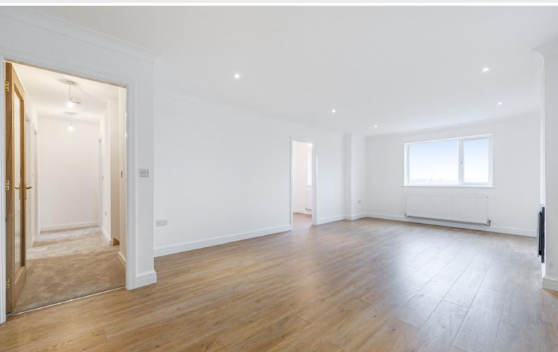
Open Plan Living/Dining Area