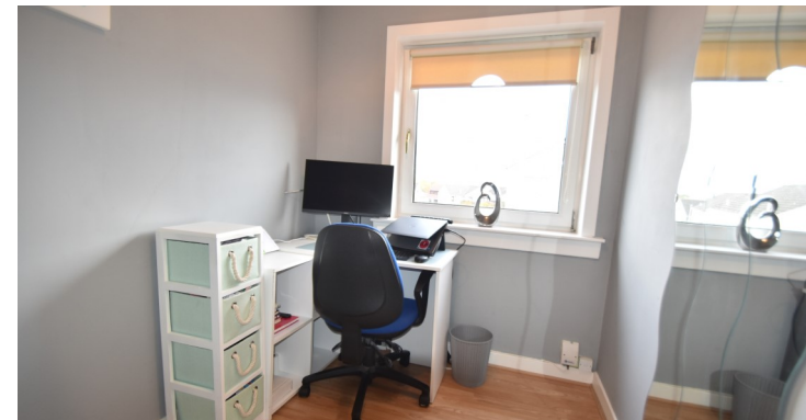
15 Greentree Lane