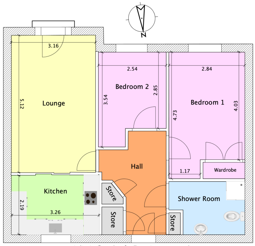
Indicative floor plans for illustration purposes only Approximate Gross Internal Floor Area 663ft2