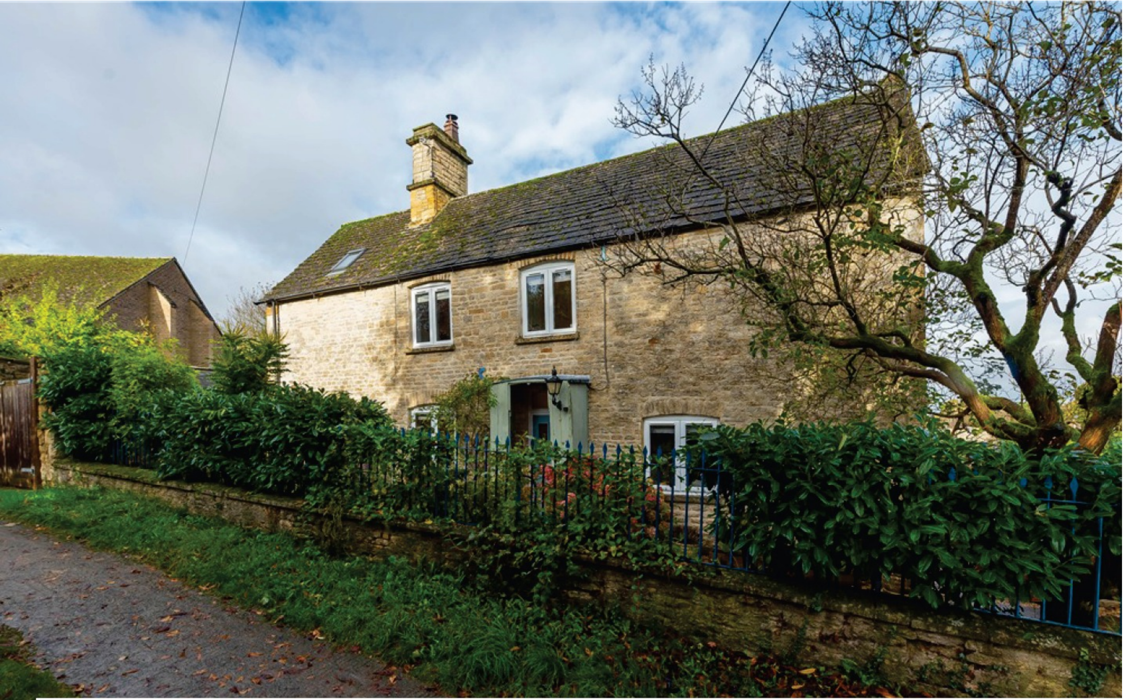
The Old School House, Finstock