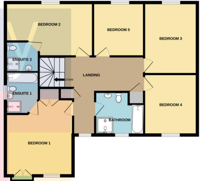
1ST FLOOR 912 sq.ft. (84.7 sq.m.) approx.