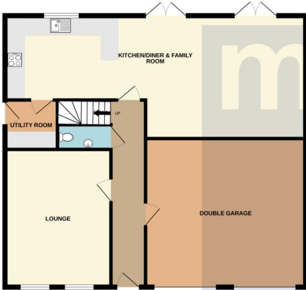
GROUND FLOOR 1076 sq.ft. (99.9 sq.m.) approx.