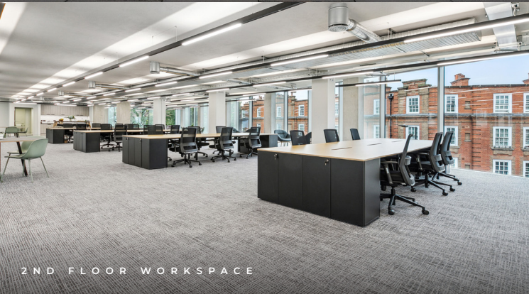
2ND FLOOR WORKSPACE