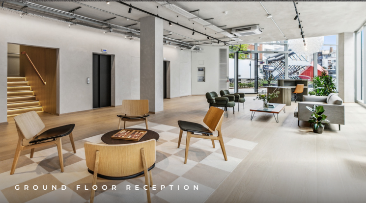
GROUND FLOOR RECEPTION