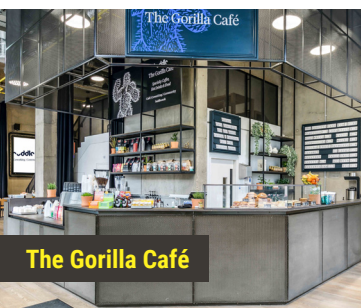
The Gorilla Café