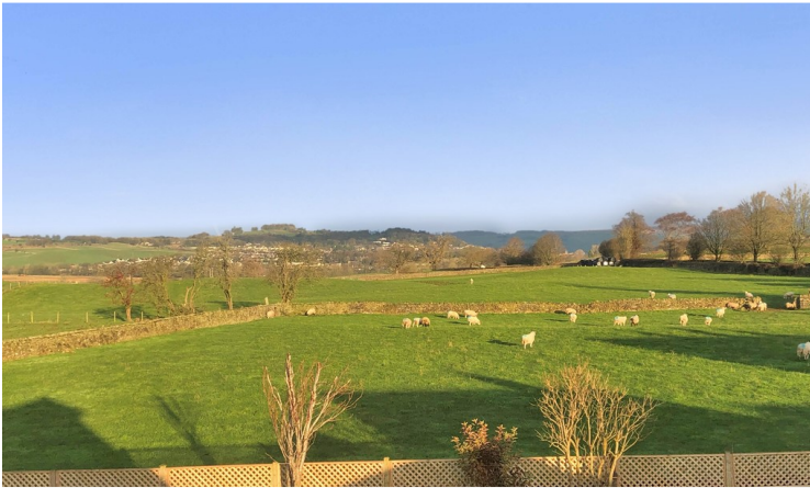
Views to Open Fields