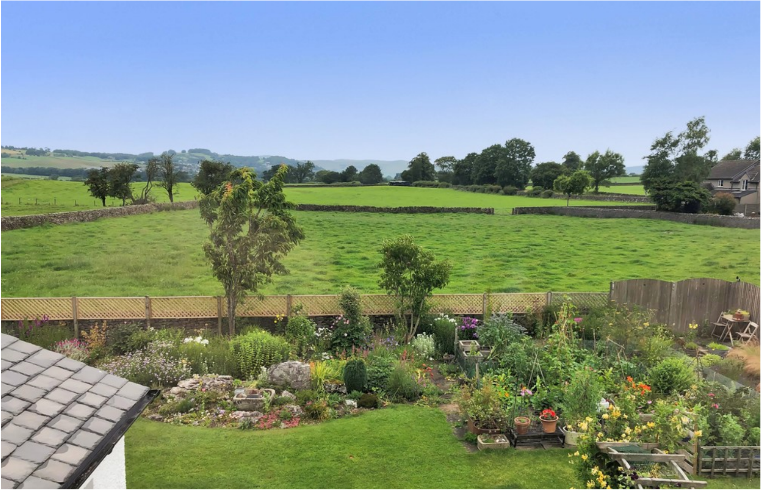
Rear Garden & Views