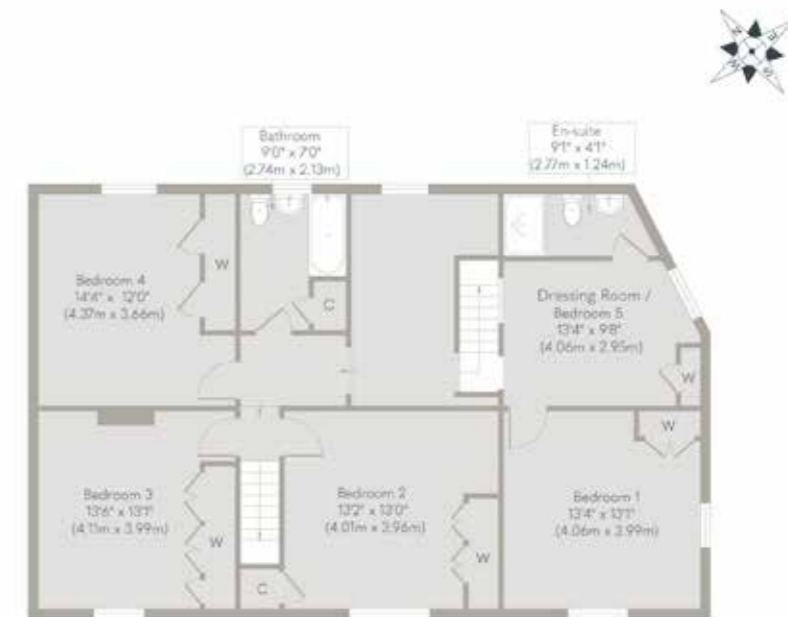
First Floor Approximate Floor Area 1177 sq. ft (109.34 sq. m)

“It’s a really nice village that’s quiet and friendly, yet close to everything you need.”