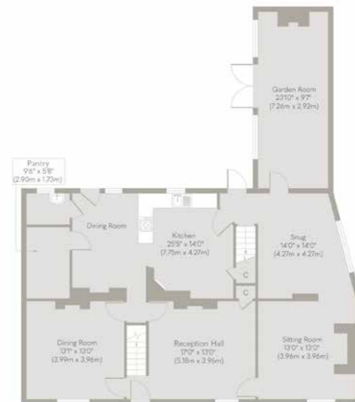
Ground Floor Approximate Floor Area 1399 sq. ft (129.97 sq. m)

Whilst every attempt has been made to ensure the accuracy of the floor plan contained here, measurements of doors, windows, rooms and any other items are approximate and no responsibility is taken for any error, omission, or mis-statement. This plan is for illustrative purposes only and should be used as such by any prospective purchaser or tenant. The services, systems and appliances shown have not been tested and no guarantee as to their operability or efficiency can be given.