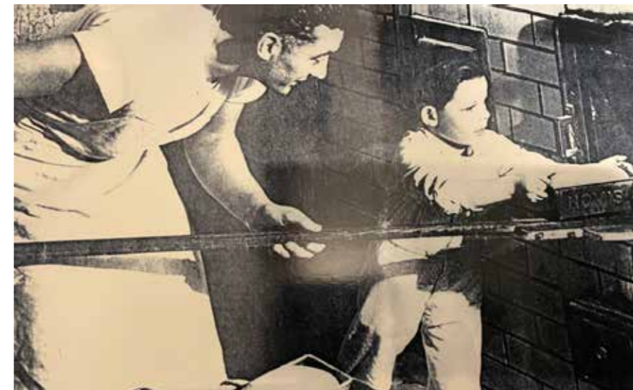
A historic photograph of the Old Bakery ovens in use.