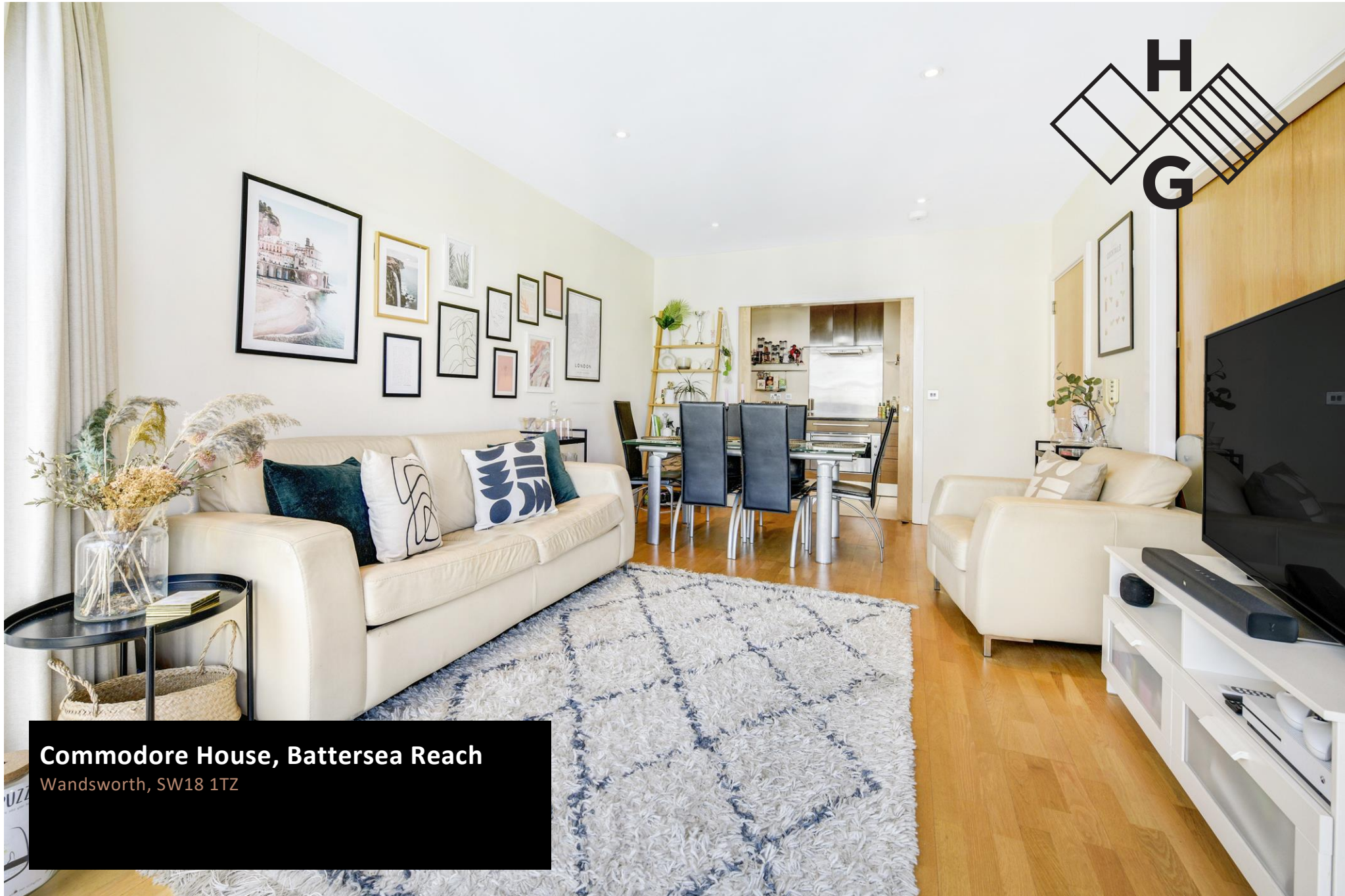
Commodore House, Battersea Reach Wandsworth, SW18 1TZ