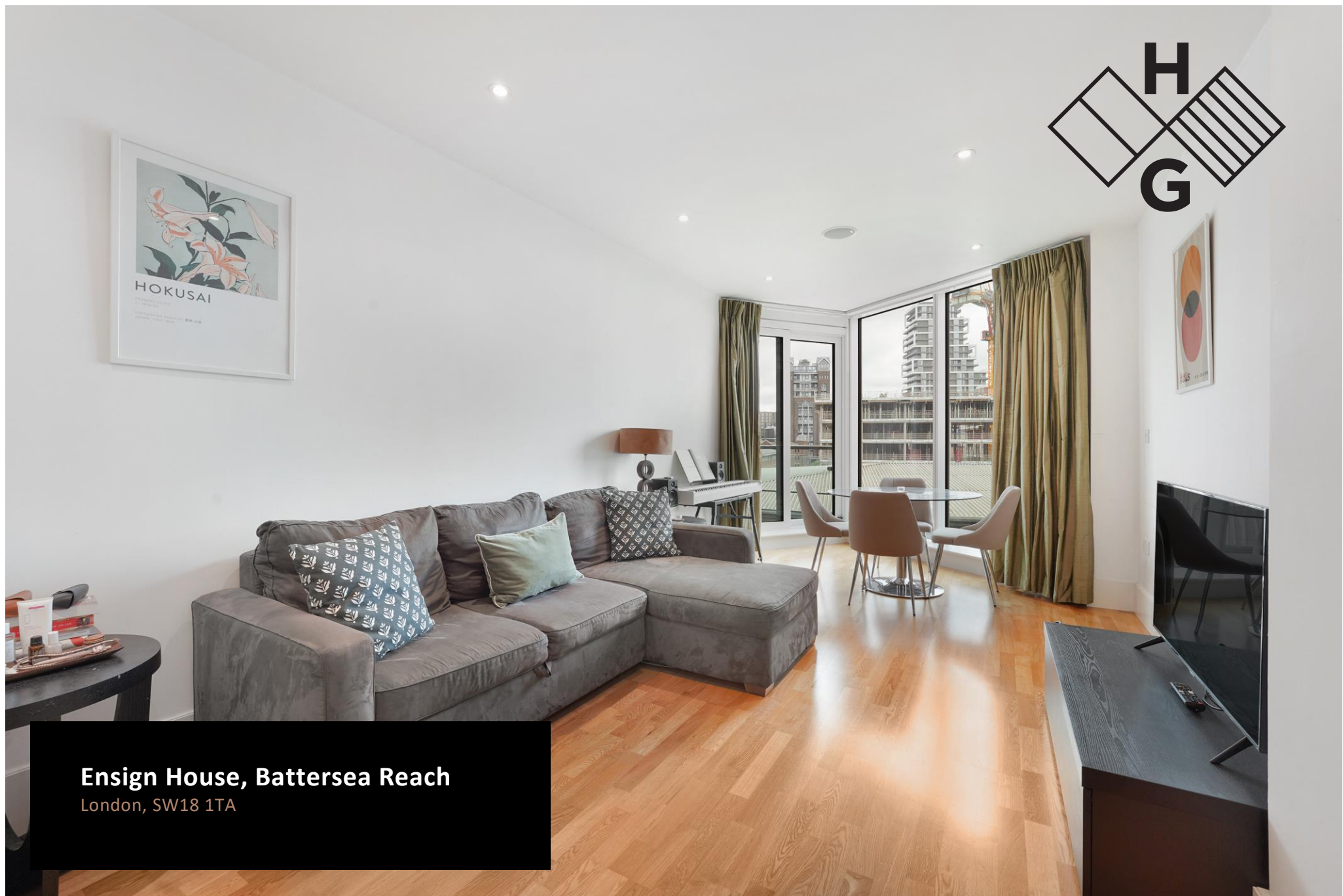
Ensign House, Battersea Reach London, SW18 1TA