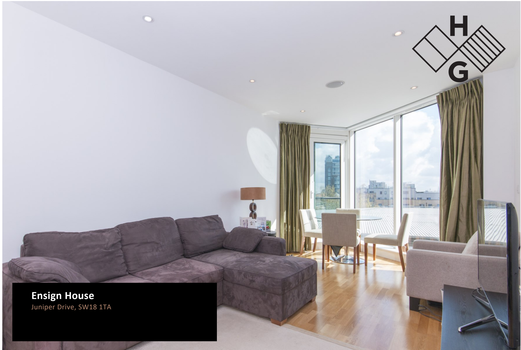
Ensign House Juniper Drive, SW18 1TA