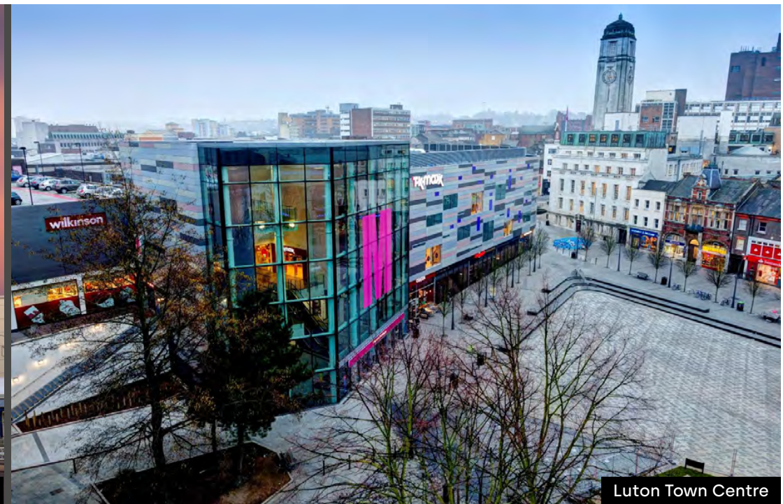
Luton Town Centre