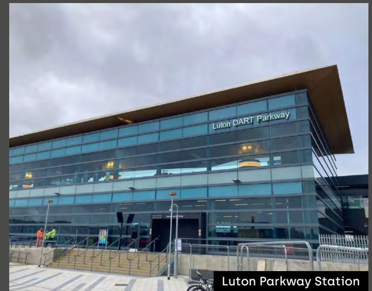
Luton Parkway Station

Luton Airport – the UK's 5th largest airport with 18 million passengers per annum - is situated approximately 2 miles to the northeast. The airport has undergone significant upgrades in recent years, with passenger capacity increasing by 50%. The recently opened Luton DART is an innovative automated light rail service connecting Luton Airport Parkway Railway Station and the airport in under 4 minutes. There are also longer-term proposals to double the airport's capacity to 32 million passengers per year by 2039.