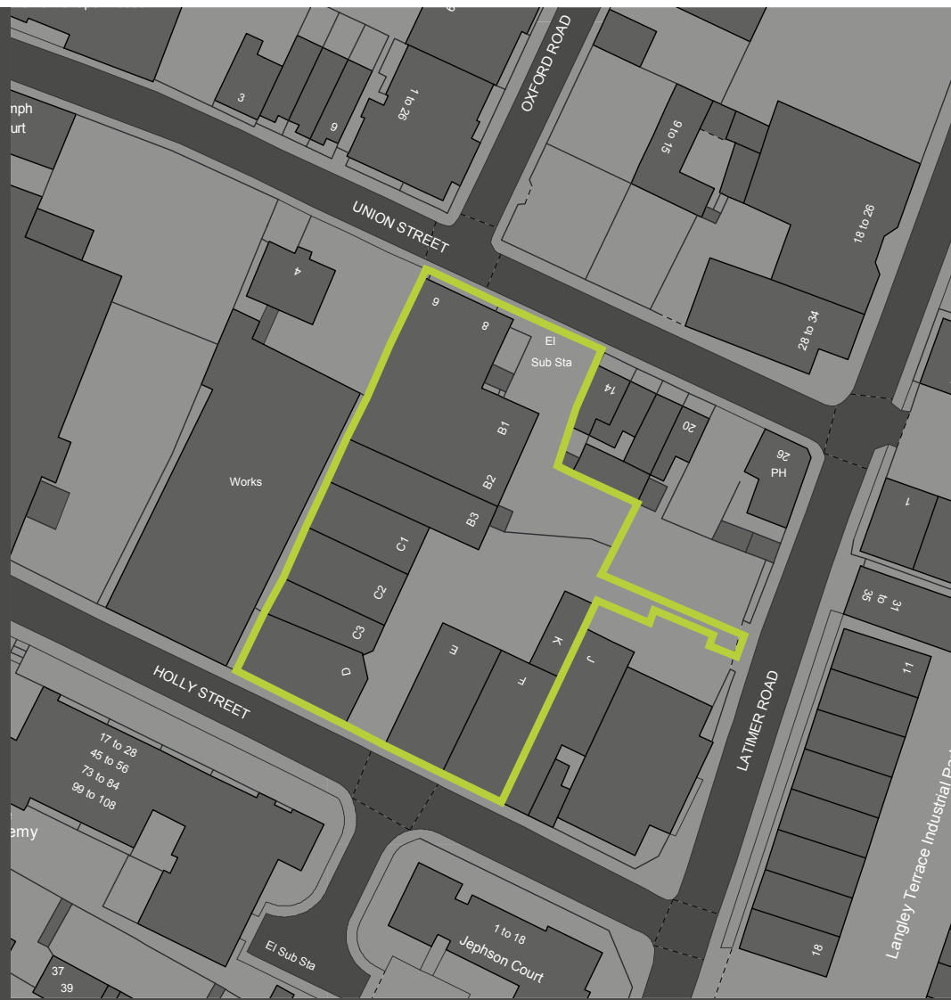
For identification purposes only.