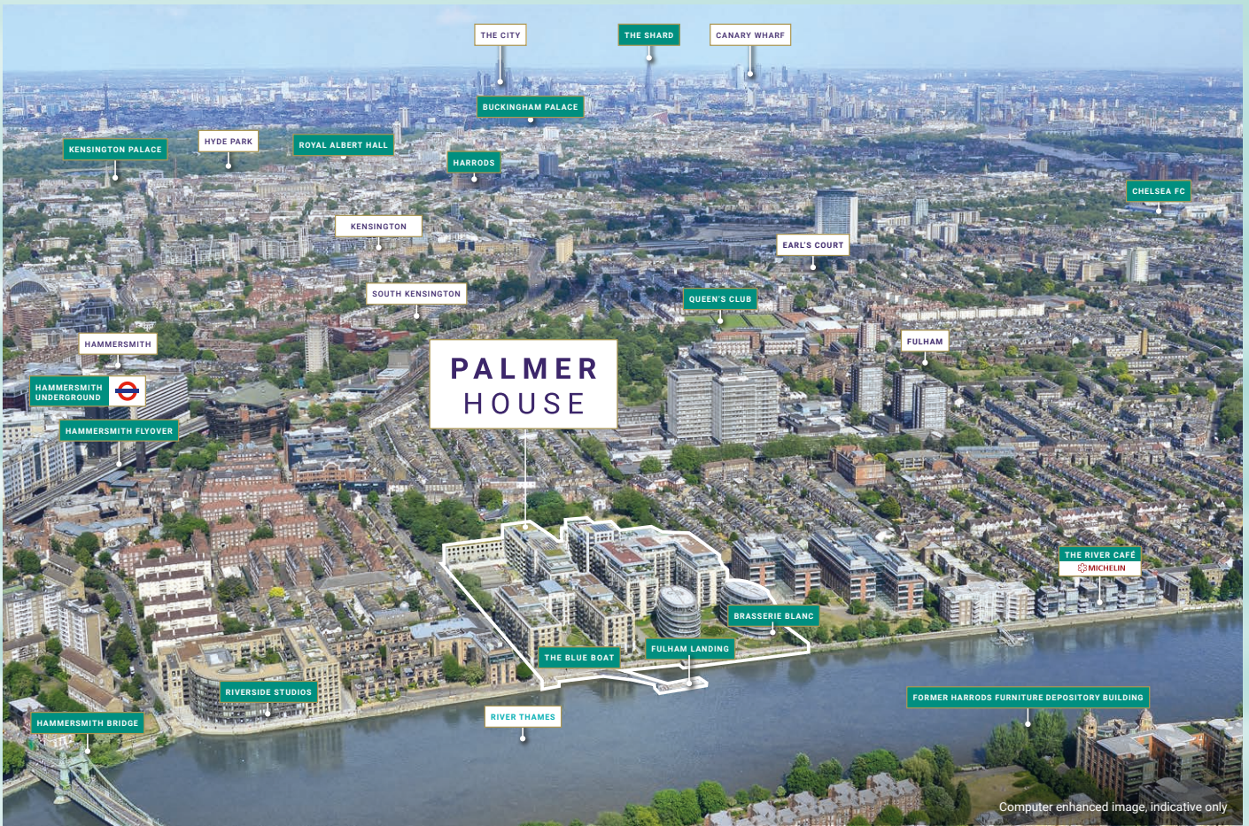
Computer enhanced image, indicative only