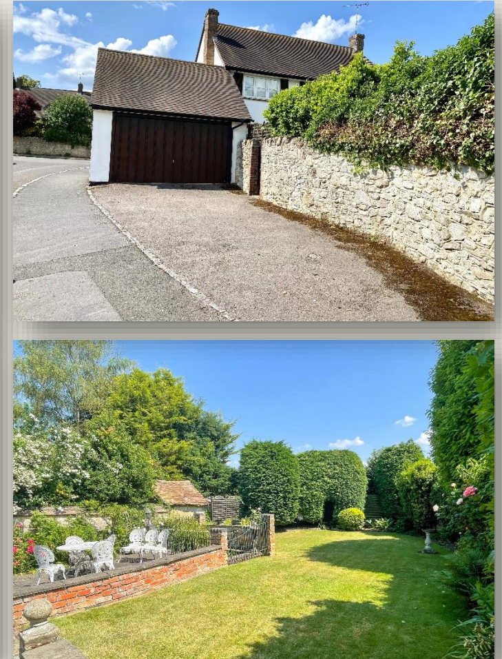
Viewing is Strictly by Appointment through Reaston Brown