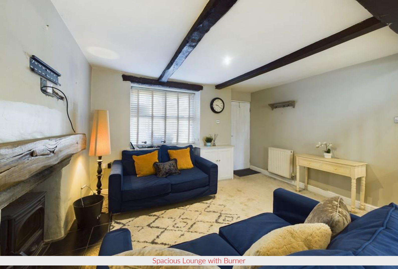
Spacious Lounge with Burner

Location: From Kirkby Lonsdale go along Main Street to the A65 and cross over. Coming into Whittington, pass Loyne Park on the right, go round the left hand bend. Pass the Village Hall on the right and the pub on the left and Browside Cottage is on the left.