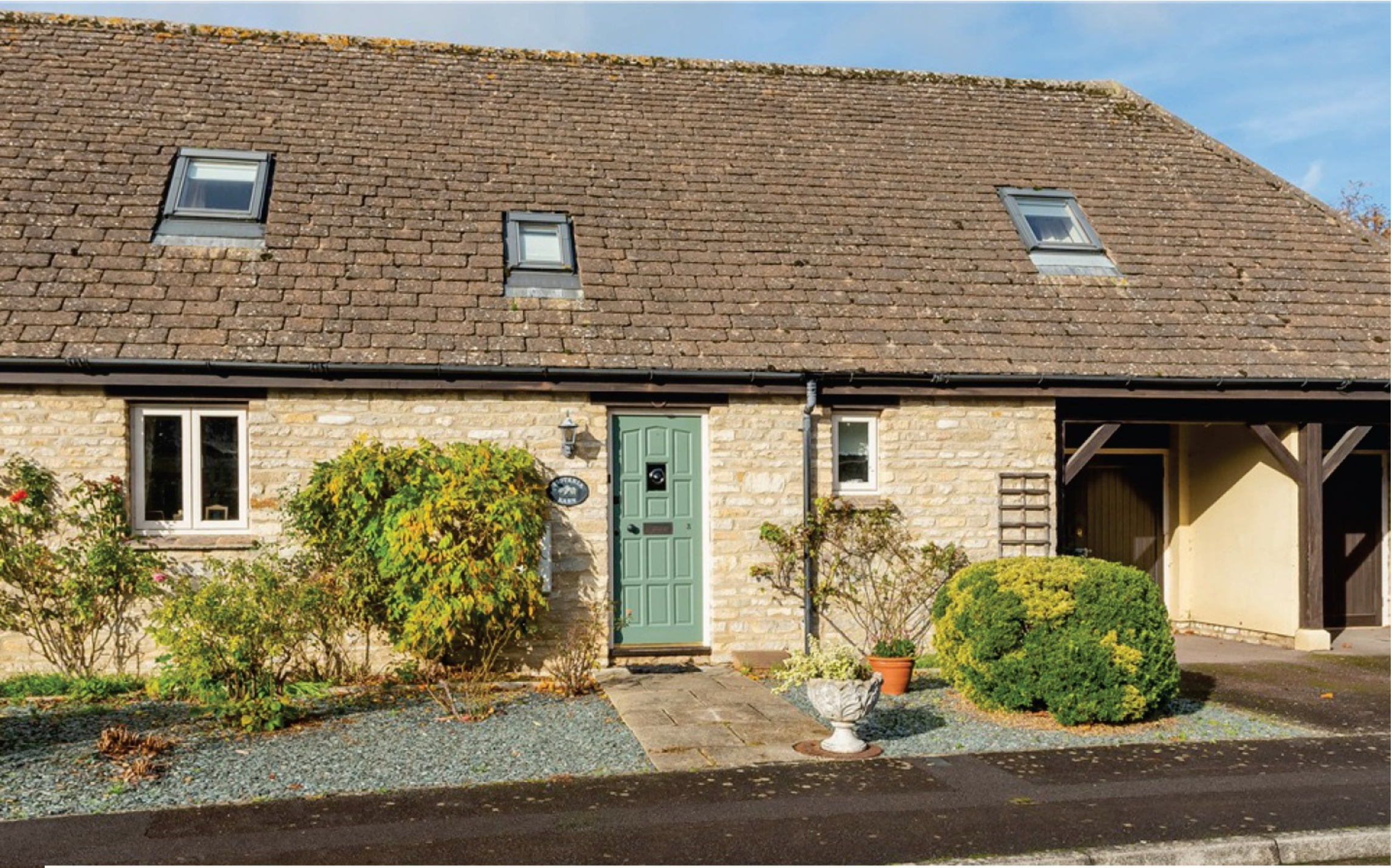
Wisteria Barn, Ducklington