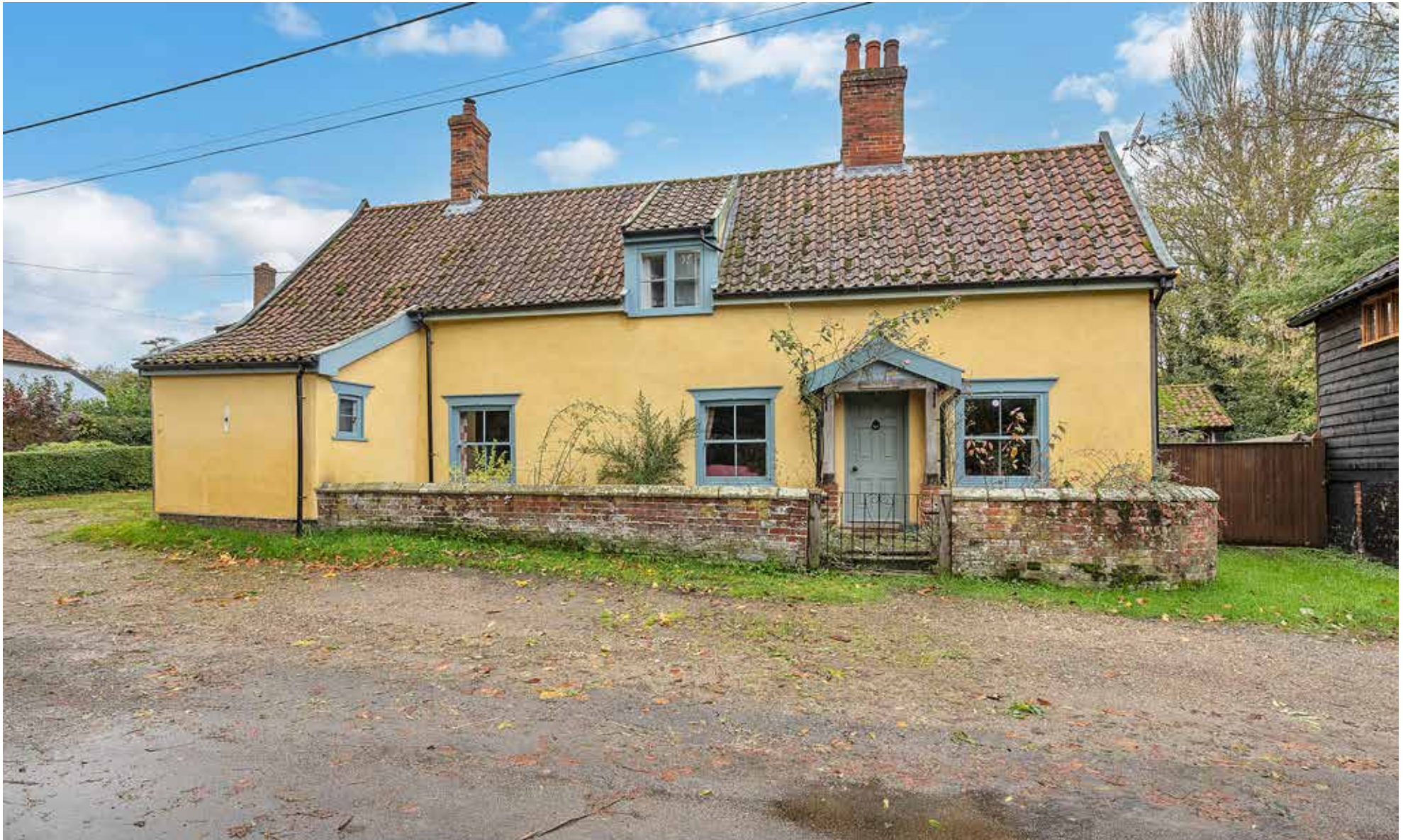
'Renovated Rural Cottage' Gissing, Norfolk | IP22 5UN