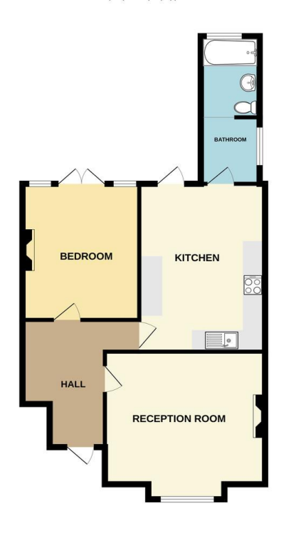
TOTAL FLOOR AREA: 706 sq.ft. (65.6 sq.m.) approx. Whist every strengt has been made to ensure the accuracy of the footplan contained here, measurement of doors, individuos, footins and any other terms are approximate and no responsibility to states for any error prospective purchaser. The services, systems and appliances shown have not been tested and no guarante, as to their operablely or efficiency can be given.