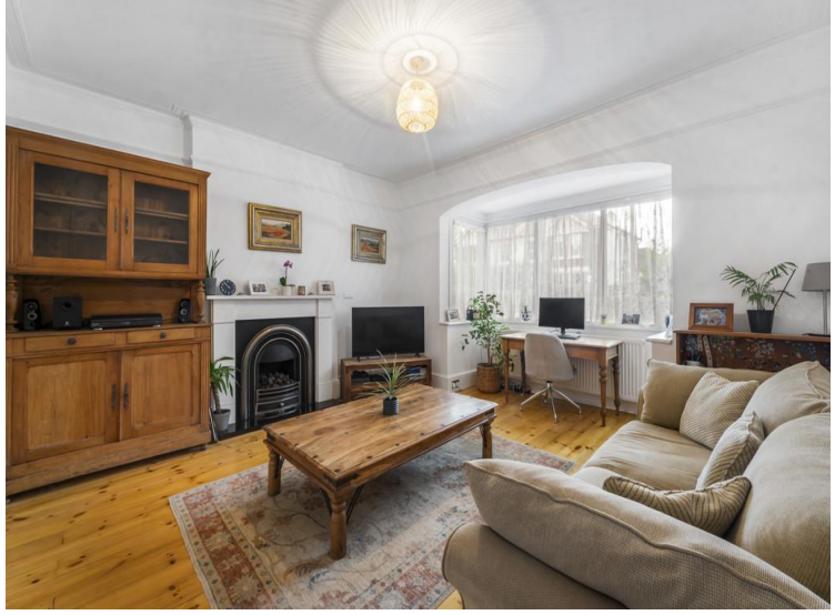
Ground Floor Flat, 55 Marchmont Road, South Wallington, Surrey, SM6 9NT | £315,000 Share of Freehold

Situated within a sought after road in South Wallington, this characterful garden flat boasts a modern interior and benefits from a share of freehold and a private rear garden. The accommodation comprises an entrance hall, a spacious lounge and an open plan kitchen/diner which has door out to the garden. There is also a double bedroom and modern bathroom. An internal viewing is highly recommended.