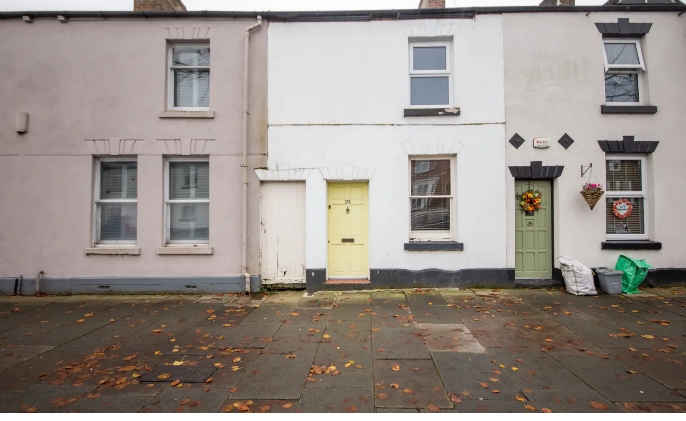
23 High Street, Newton-Le-Willows Offers in Region of £150,000