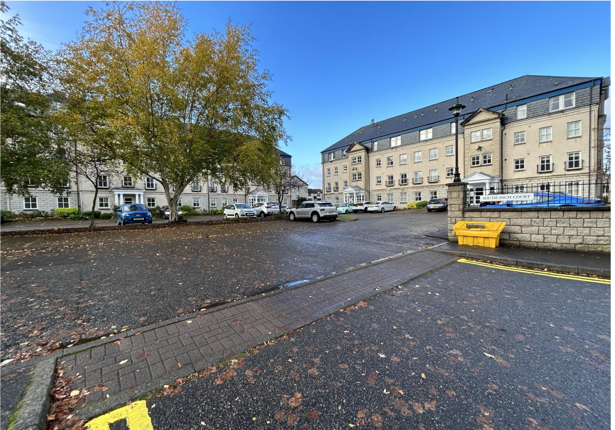
Next Home - 2F South Inch Court, Perth, PH2 8BG